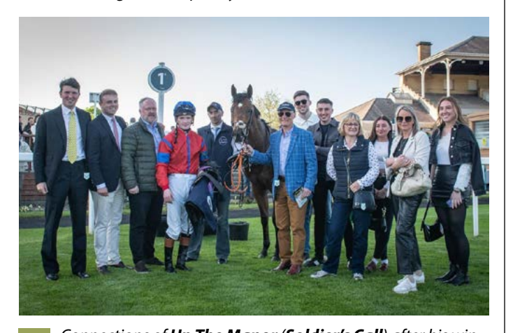
Connections of Up The Manor ( Soldier's Call ) after his win on debut at Doncaster.

"Up The Manor is probably the most exciting going forward, he won at Doncaster and had only been with me a month after coming from the Breeze-Up sale. He's a small, sharp, ready sort and went straight back into exercise. His two bits of work before Doncaster were good and he showed plenty. He did it well and learnt on the job and although we're finalising plans, we could potentially go to the [Listed] Windsor Castle Stakes at Royal Ascot. I think he is a genuinely nice horse and if he can improve a bit between now and then, he should be bang there, hopefully."