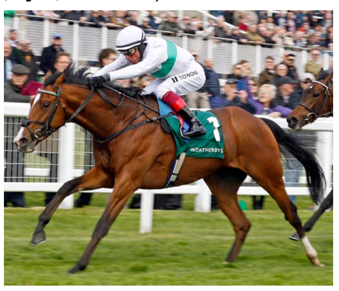
Epictetus ( Kingman), who is set to be the only British representative in a small field for Sunday's Gr.1 Prix du Jockey Club at Chantilly.